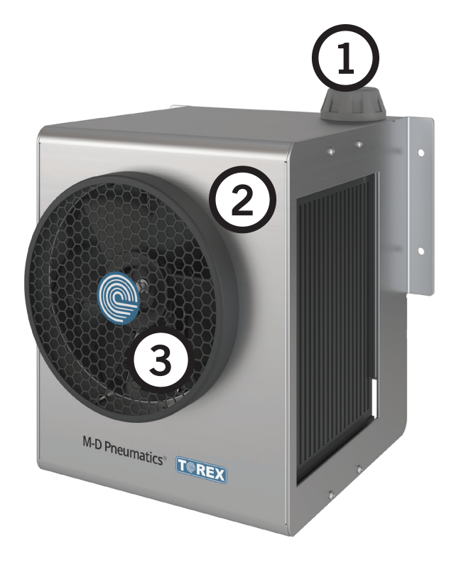
TOREX hydraulic oil cooler exterior.